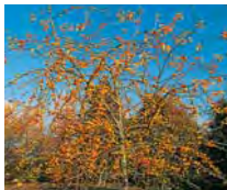
l'automne lohtonn fall