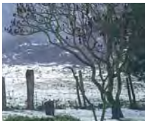
l'hiver leevair winter