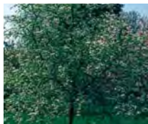
le printemps luh prahntohn spring