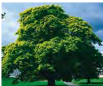
l'été laytay summer